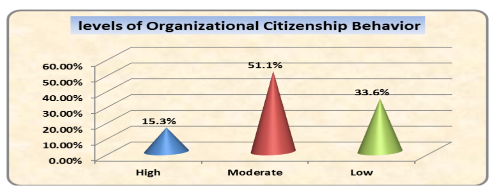
Figure (3): Percentage distribution of levels of organizational citizenship behavior as reported by nurses (n= 190).

Table (5): Correlation matrix between level of leader-member exchange, empowerment, and organizational citizenship behavior among nurses (N=190).